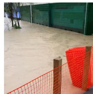
Figure 1 May 9th Flooding behind the squash courts

1.6 The exec committee has also formally engaged with council to address our concerns around future flooding and ways we can mitigate this risk. We will need to continue to engage and campaign for pragmatic solutions from council. The flooding on May 9 th reminded us that this will continue to be an issue and a threat to the club.