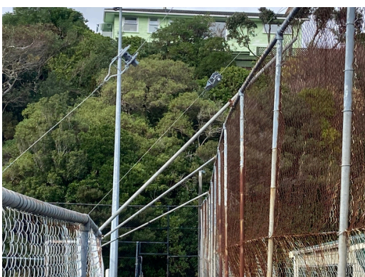
Modern art or scout preservation? Our Southern fence has a new look these days..

Volunteers always wanted - if you have any way you can help onsite or with fundraising ideas we would love to hear from you!