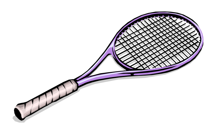
Have a Great Season 1999/2000