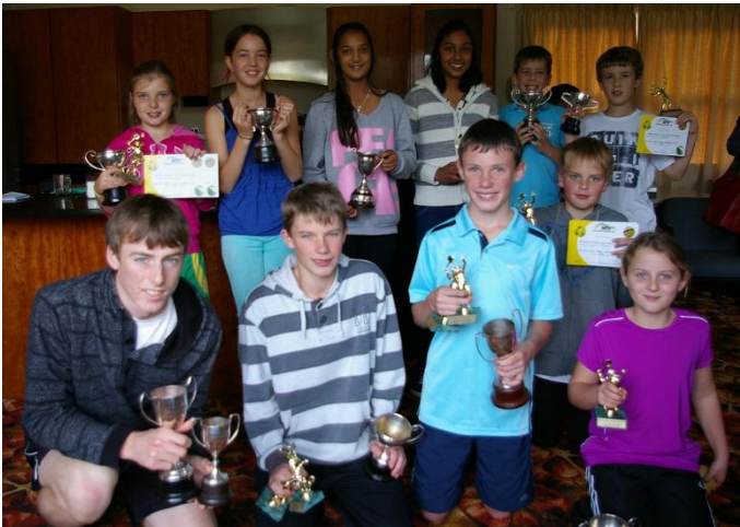
2012-13 Junior Trophy Winners