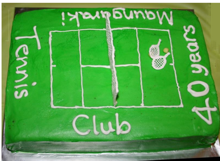
The fabulous 40 th Party Cake!