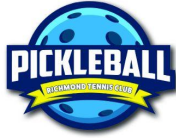
Proposed pickleball courts at Richmond Tennis Club

The colour scheme will be a green background against a blue court with gray 'kitchen'. This is to match the colours of tennis courts 1 to 7.