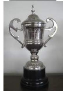
Beverley Evans Trophy