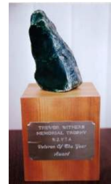
Trevor Withers Memorial Trophy