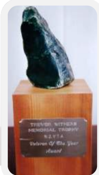
Trevor Withers Trophy