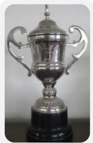
Beverley Evans Trophy

The Awards for the following trophies on page 2