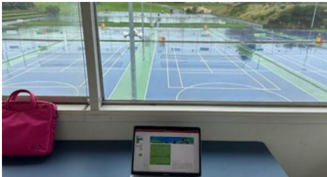
Not a bad view from the new office at Vautier Park!

An email will be sent out to clubs once the draws are on the website. Make sure you start referring to the TMI website for season information which includes a season calendar and tournament information. TMI will continue building the website as information comes to hand so please use this as a reference. Also, please refer to the TMI facebook page for interclub and tournament updates.