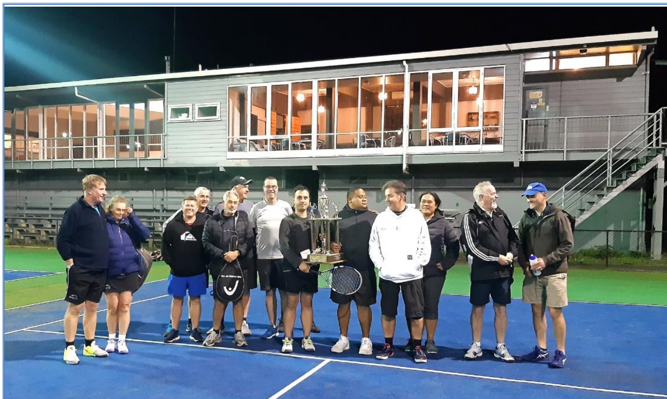
An assortment of our 'best' Mitchell Park Wednesday Night Business House Tennis Competition players at our last prizegiving night held on 17 May 2023. This is the last time tennis courts 1-4 were used in competitive play before the indoor court structure build got underway.

I'd like to thank everyone who participated in our Business House Competitions. Most of these teams have been participating in our competitions for many, many years.