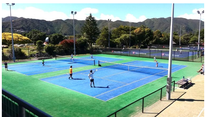
Sand removal courts 5 - 13