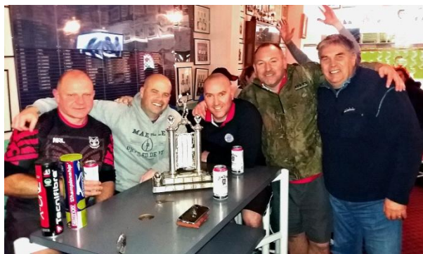
Wednesday night winners