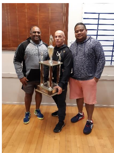
WEDS BIZ HOUSE TEAM: PRISON BREAK