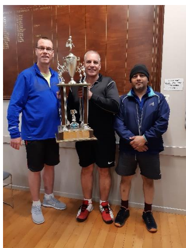
WEDS BIZ HOUSE TEAM: RSB

A special mention must be made to our HVT Mitchell Park Business House tennis players who compete in our fun / competitive Wednesday and Thursday night doubles competition. The event provides a fantastic opportunity for everyone interested in tennis to compete in a fun and friendly environment.