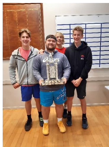
THURS BIZ HOUSE: I'D HIT THAT