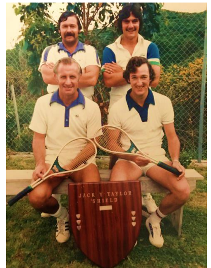
MTC PREMIER INTERCLUB CHAMPIONS 1979