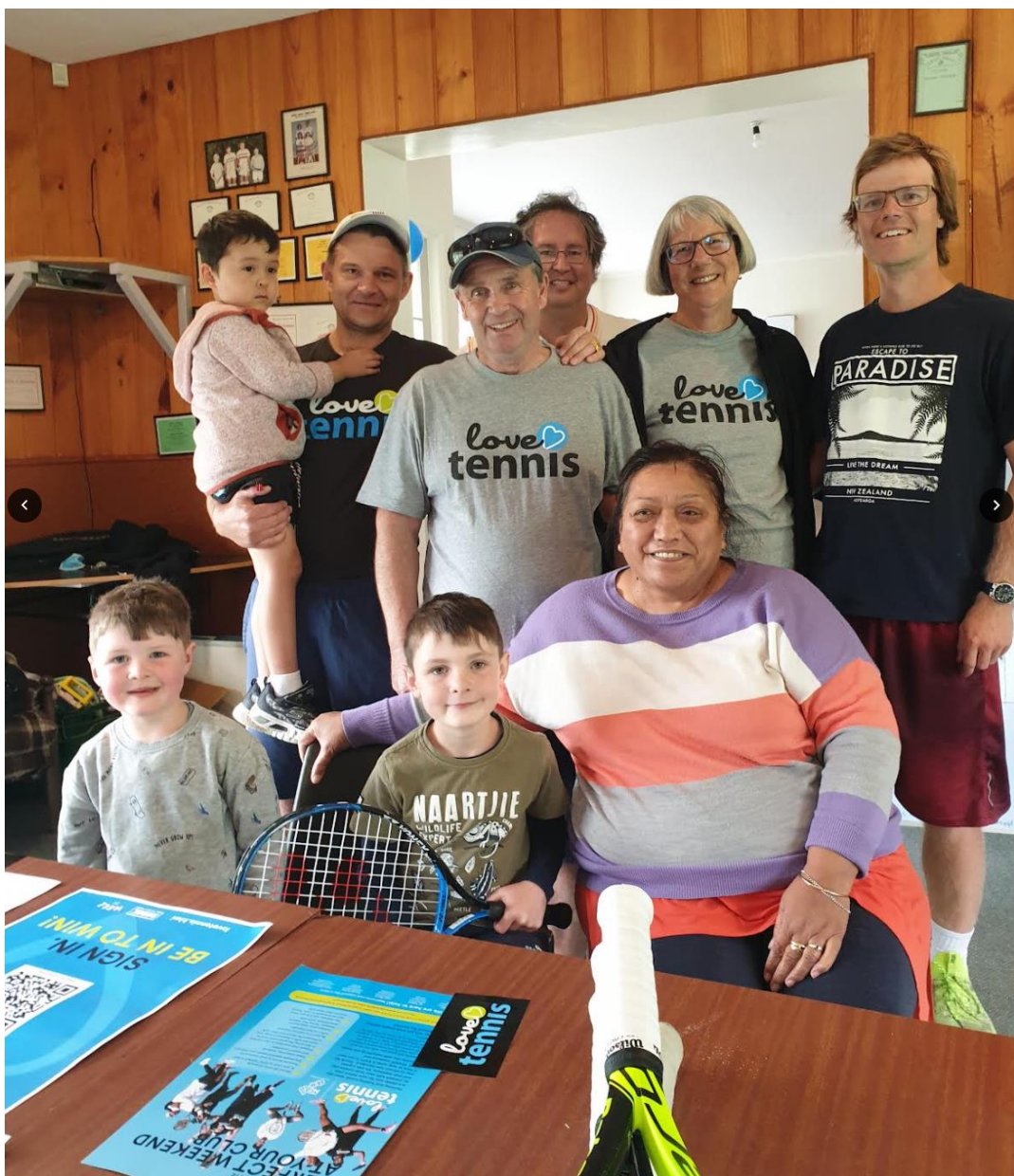
A group of volunteers and coach from Stokes Valley Tennis Club