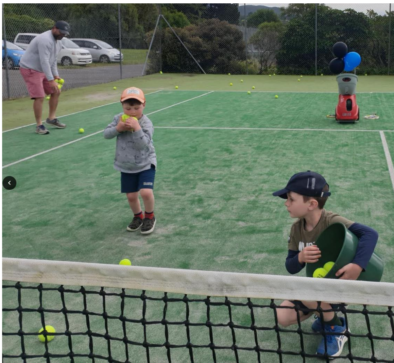
Nurturing the next generation of tennis players