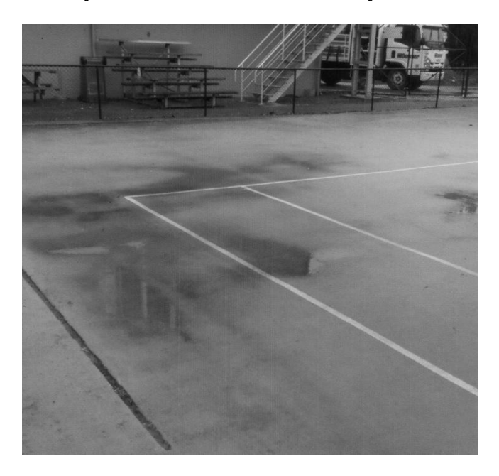
Court 1: Puddles near the drains. A full set of photographs has been taken for these courts to help with filling low points before any artificial turf is laid.

4. Asphalting: Quotes were received for asphalting all four front courts. The expense of asphalting and a synthetic surface were not considered viable at this time, especially as investigations showed that the levels of the existing base showed it would need considerable remediation before resurfacing and a new drainage system would also be needed. In the case of courts 3 & 4 the HVT Committee were advised that excavation would require removal of the base and the digging up of the remains of the old concrete court that extended under court 4 and part of court 3.