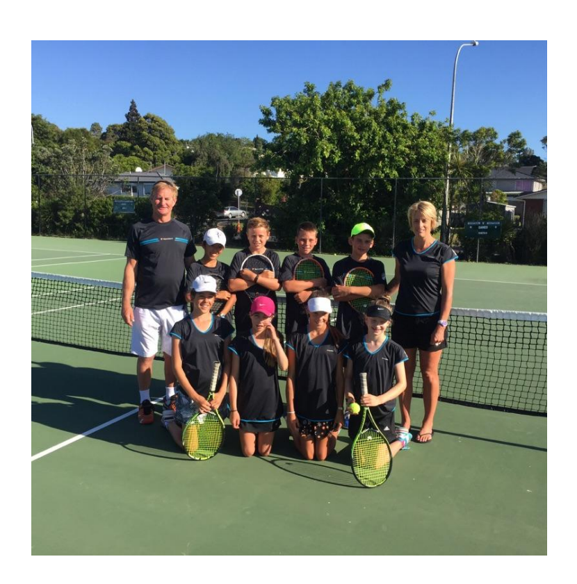
U12s Central Team in Auckland Jan 2014