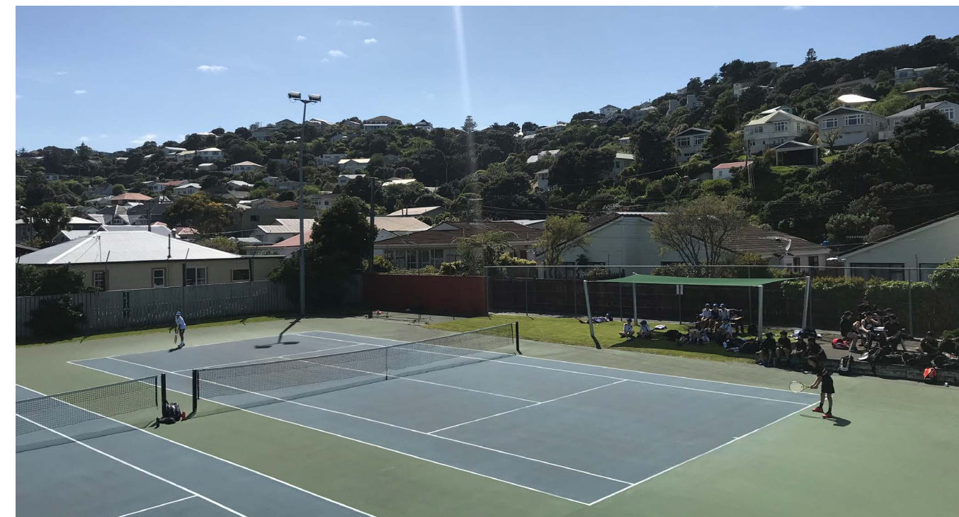
Scots College v Wellesley College, Traditional Sports Day